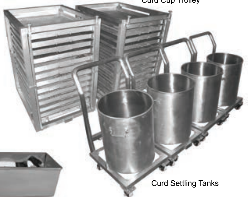
Curd Cup Trolley