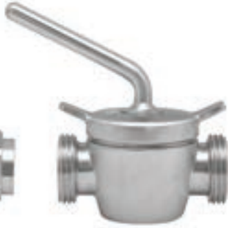
Plug Valve - 2 Way