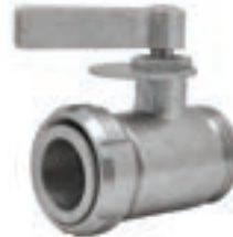
Flow Diversion Valve