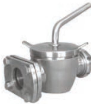
Flanged End Plug Valve