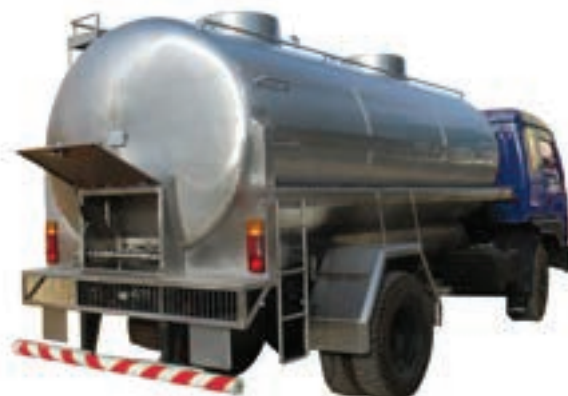
Road Milk Tanker