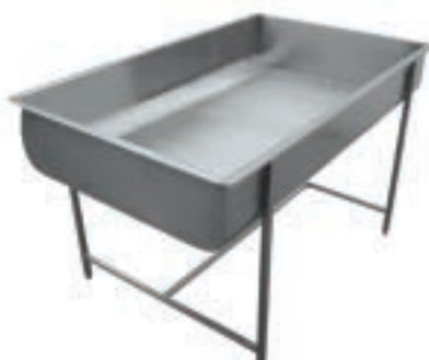
Lid Wash Throw