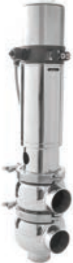
Double Seat Pneumatic Valve