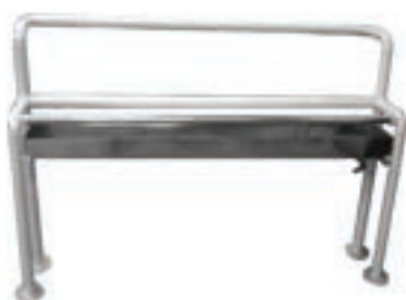
Can Drip Saver