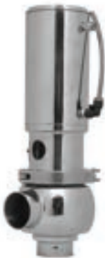
Single Seat Pneumatic Valve