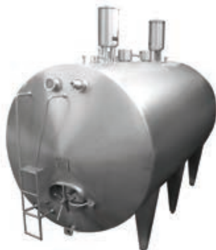
Horizontal Milk Storage Tank