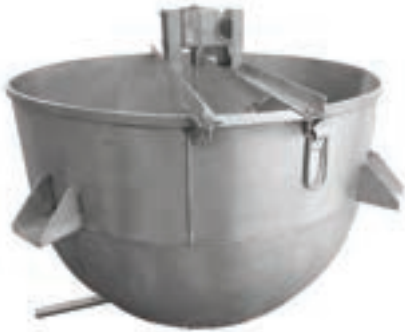
Customised Ghee Boiler