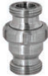
Check Valve (NRV)