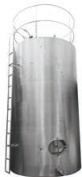
Vertical Milk Storage Tank