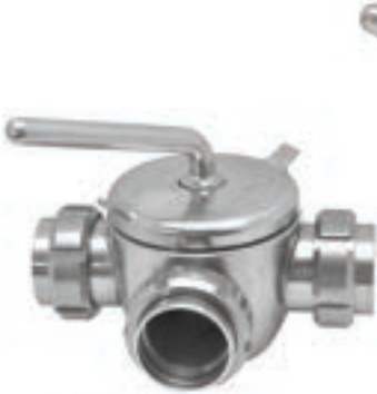
Plug Valve - 3 Way